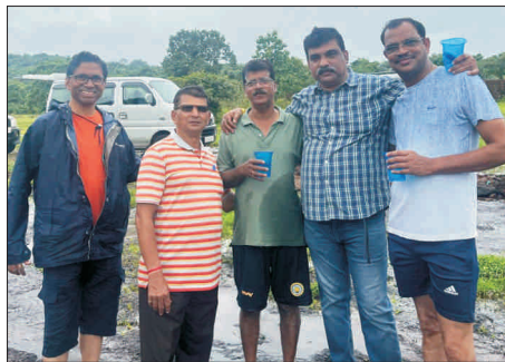
For Senior Rotarians, it is a time to unwind and spend some quite time away from daily chores