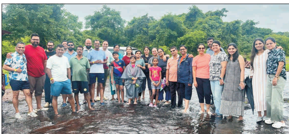
Members of RCB family who enjoyed this annual monsoon trek pose for a Group Photo