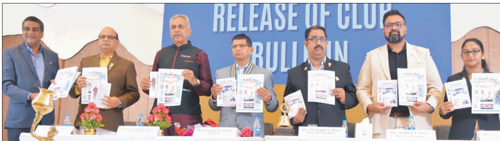
Release of Monthly Club Bulletin "Amigo" (June 2025 and July 2025 Issues)