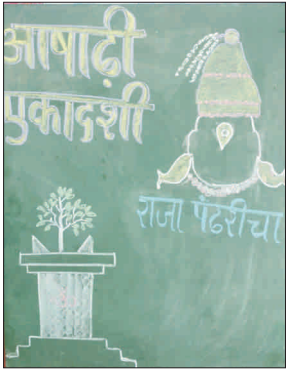
On the occasion of Ashadi Ekadashi, Wall Paper prepared by Miss Veda Sawal (Std III) was released