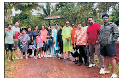
Now ... its' time to return back and a group photo from remembrance