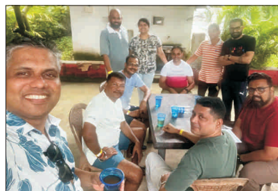
It is time to relax and enjoy a drink after a adventurous trekking....