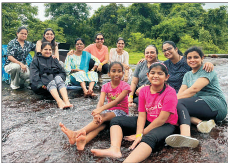
Ann's and Annette's enjoy the cool, misty climate at the side of waterfall