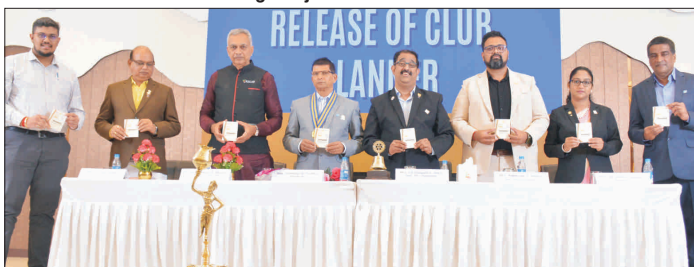
Release of "Fellow-book" - Club's Directory cum Yearly Planner