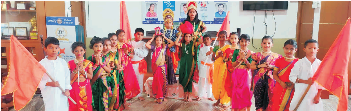
Students of Std III and Std IV performed Dindi during this celebration