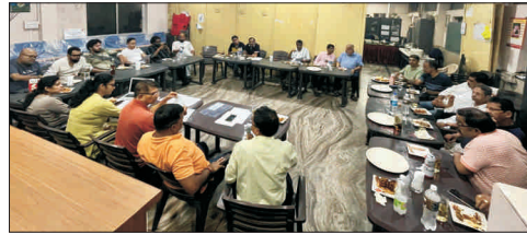
BOD members attended in large numbers and actively participated in the deliberation