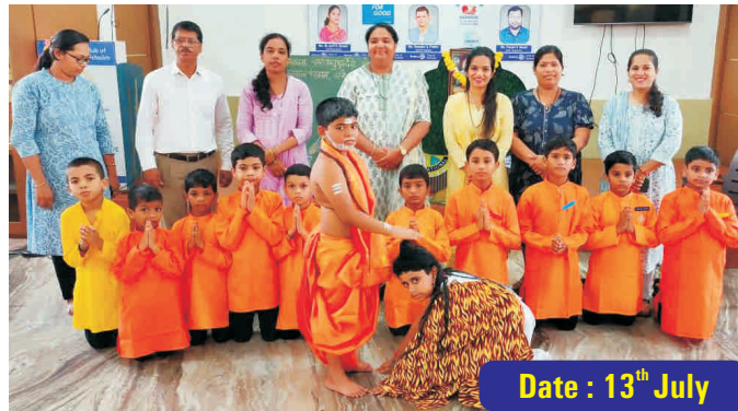
Chief Guest, Teachers pose for a group photo with the students who participated in the dance on Dronacharya and Eklavya relationship highlighting dedication of the disciple